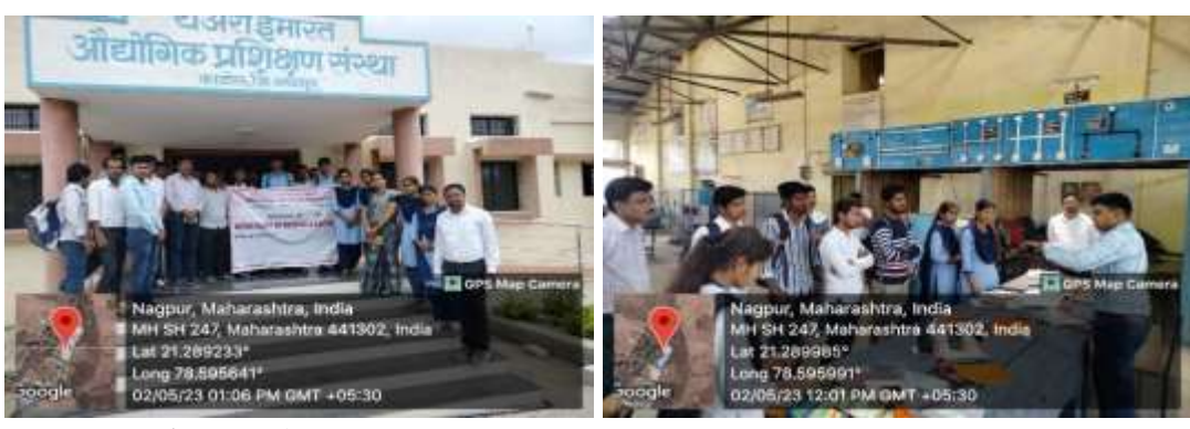
Govt ITI, Katol on 02nd May 2023