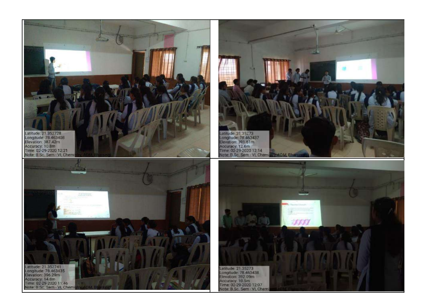
Quiz Competition Activity