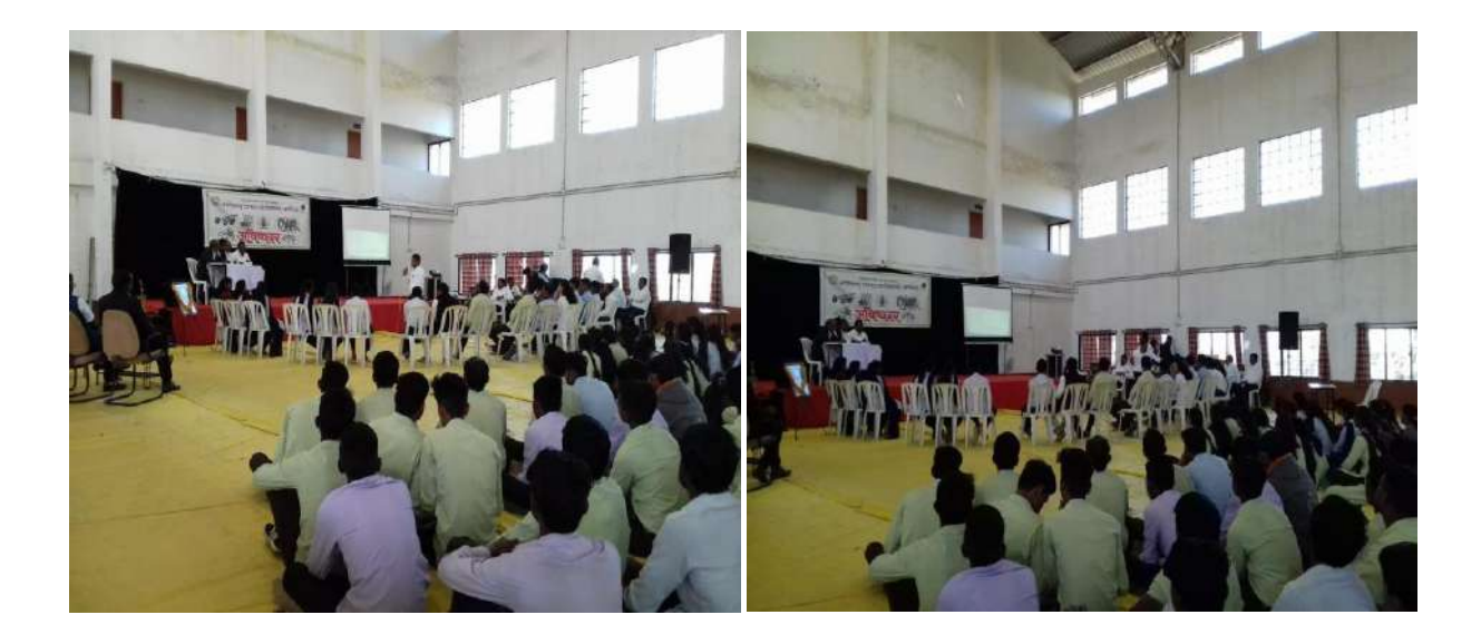
Science Day Programme